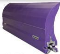
Rockline Urethane Belt Cleaner Blade