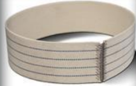
Cotton Belt with Clipper Belt Lacing