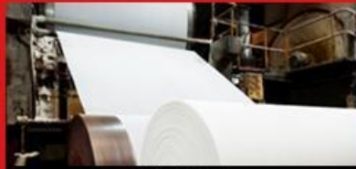
Pulp & Paper