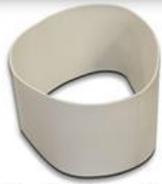
White FDA Nitrile Sleeve