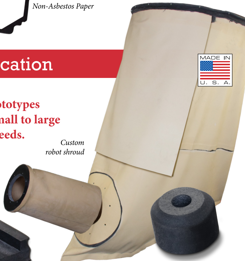
Machined Neoprene Tapered Bushing