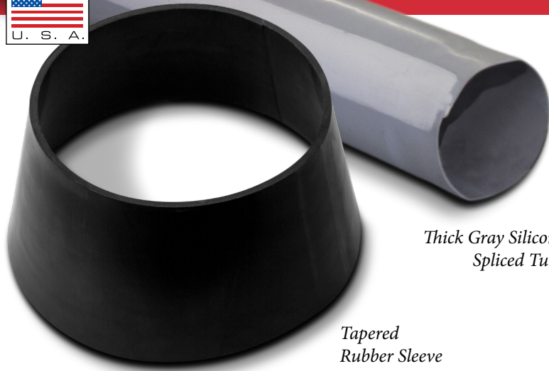
Thick Gray Silicone Spliced Tube