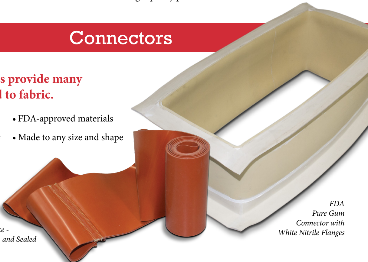
FDA Pure Gum Connector with White Nitrile Flanges