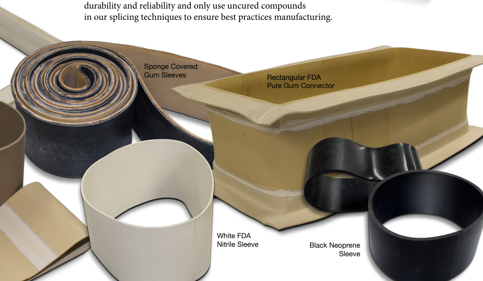
Sponge Covered Gum Sleeves