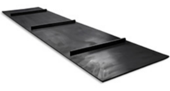
Separator Belt 3" High Cleats