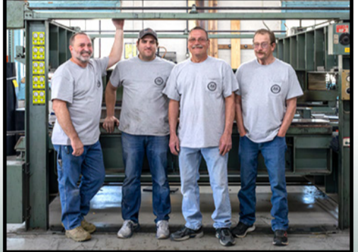
The Dad Crew at RK RUBBER

"The older a man gets, the more he values everything his dad gave him."