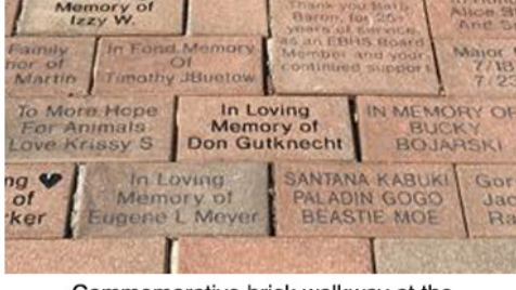
Commemorative brick walkway at the Elmbrook Humane Society