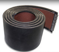
Heavy Duty 750# PIW Conveyor Belt with V Guides Each Edge and Flexco Fasteners