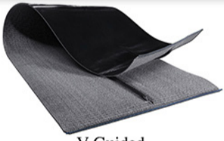
V-Guided Light Weight Belts