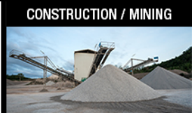
CONSTRUCTION / MINING