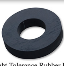
Tight Tolerance Rubber Ring 1" Thick Machined OD