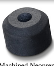
Machined Neoprene Tapered Bushing