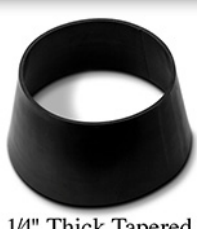
1/4" Thick Tapered Rubber Sleeve