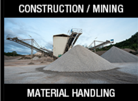
CONSTRUCTION / MINING