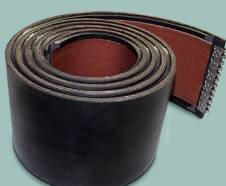
Heavy Duty 750# PIW Conveyor Belt with V Guides Each Edge and Flexco Fasteners

Different belt compounds are available for various conveying conditions.