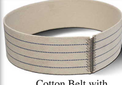
Cotton Belt with Clipper Belt Lacing