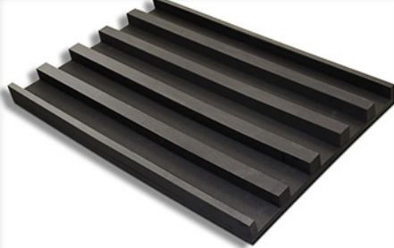
Foam Wrench Rack