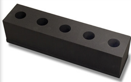
PE Foam Tool Holder