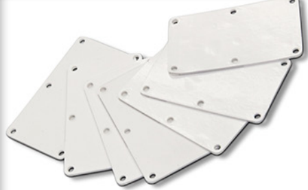
Die Cut White Nitrile Gaskets